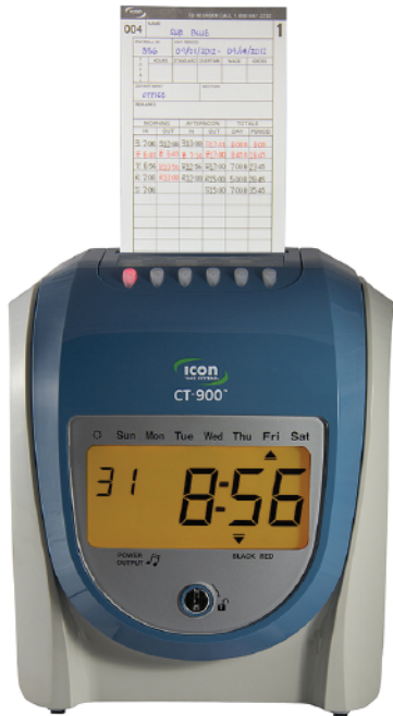
Dimensions: 4.2 x 7.5 x 8.9 in (D x W x H)